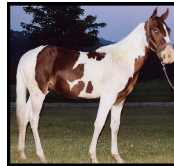
Pocos Twisted Spyder, 2004 Paint Colt (Pocos