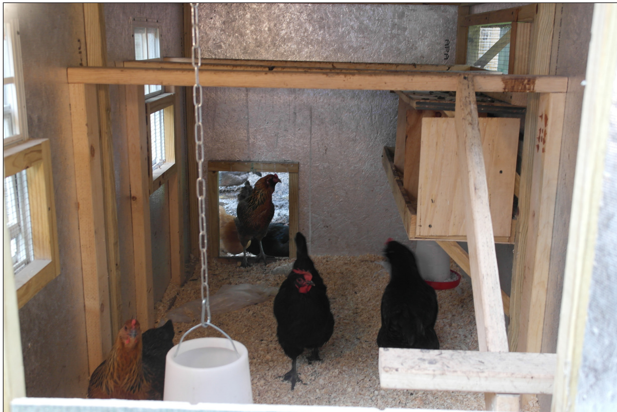
Figure 2. This larger, mixed flock of hens is provided with a larger chicken house and run. Again, wood shavings are used as the bedding. The nest boxes are accessible from the outside for easy egg pickup. While the feed is indoors, the water is outdoors. The perches extend over the nest boxes which can be a problem requiring the tops of the nest boxes to be cleaned on a regular basis to prevent build up and odor problems. Again the run is completely covered to protect the hens from ground and aerial predators.