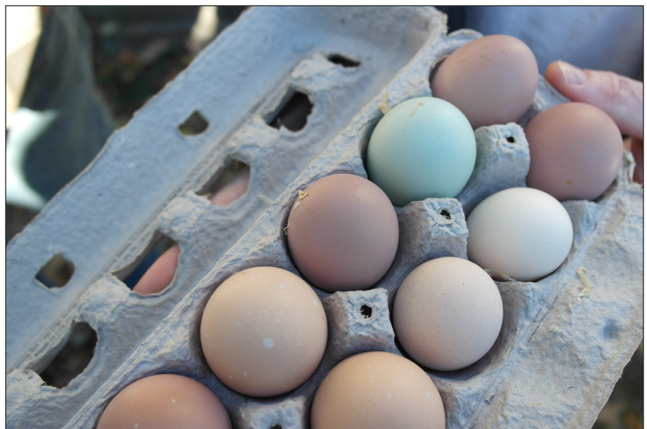
Figure 5. A dozen of eggs from a flock with a mixture of chicken breeds.