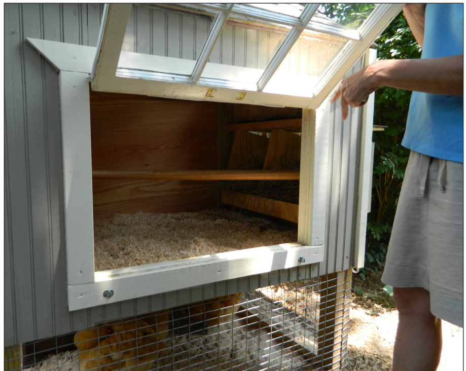
Figure 1. This chicken house is ideal for a trio of hens. They have shelter from the weather and a run to go into for fresh air. The chicken house has wood shavings for bedding, a perch, and nest boxes which can be accessed from the outside for easy egg pickup. The window on the side can be opened for easy clean out of the house interior. The feed and water are provided outside, to encourage them to use the run. The run has a sand base which is cleaned out regularly, much like a litter box. The run is completely covered with wire to provide protection from predators. The run could have been a little taller to make cleanout of the run easier, but it is functional as is.