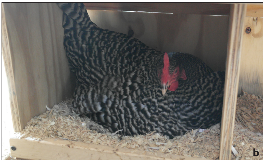
Figure 3. Examples of perches (a) for a small poultry flock and nest boxes (b) for a small laying flock.