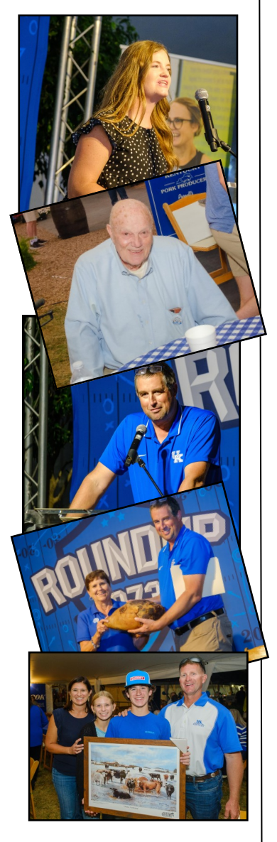
On the web http://afs.ca.uky.edu