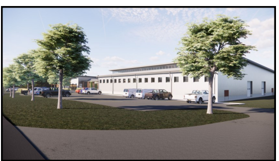
Artist's renderings of the Meats & Foods Workforce Development Center