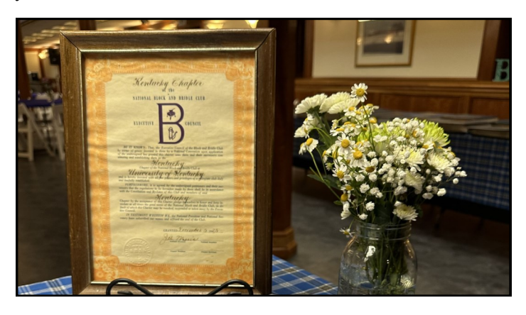
Original Block and Bridle charter dated December 3rd, 1923

The Kentucky chapter received its charter from the National Block and Bridle Club on December 3, 1923. Since the charter, the chapter has initiated approximately 5,000 members. There are currently 60 UK students in this year's cohort.