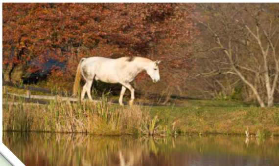
with a higher risk of developing laminitis should out in the very early morning hours.

Laminitis in horses can strike any time of year, for a variety of reasons, but veterinarians and horse owners see endocrinopathic cases most commonly in spring and autumn. Understanding your horse's risk level for this painful and potentially deadly hoof condition—and the physiological differences between spring and autumn