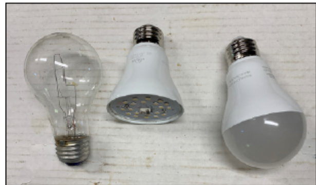
Figure 1. Incandescent (left) and LED lamps (center, with globe removed, and right).

In less than a decade, the entire world (poultry industry included) has made a dramatic shift from incandescent lamps to dimmable LED lamps. Despite some growing pains along the way, the energy savings and long-life potential of LED technology made the frustration worth it. However, within the poultry industry during the past 8 to 10 months, widespread problems with rapid