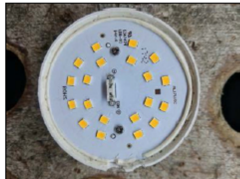
Figure 2. LED lamp with globe removed to show LED chips.

lumen depreciation, erratic dimming performance, and premature total lamp failure have been reported on LED lamps that were only 2 to 3 years old; in many cases, several years before the warranty had expired.