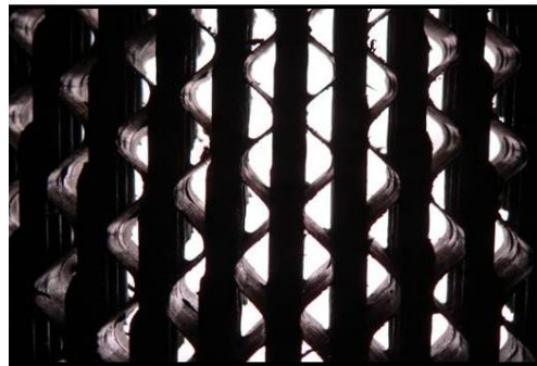
New 2" Pad