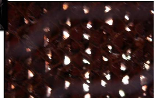
Old 2" Pad

holding the pad together to maintain its integrity and also helps reduce the buildup of algae. To reduce the growth of algae, an algicide can be used in the water for the cooling pads.