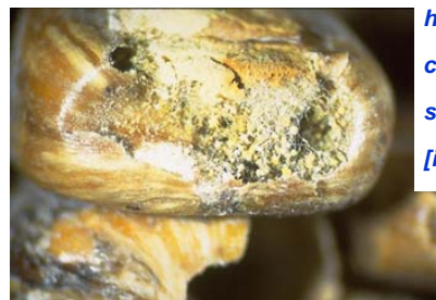
Figure 1. Sporulation of Aspergillus flavus in an insect-injured corn kernel.

More information on aflatoxins and their control is in the UK Extension Publication, Aflatoxins in Corn , available at http://www.ca.uky.edu/agc/pubs/id/id59/id59.pdf .