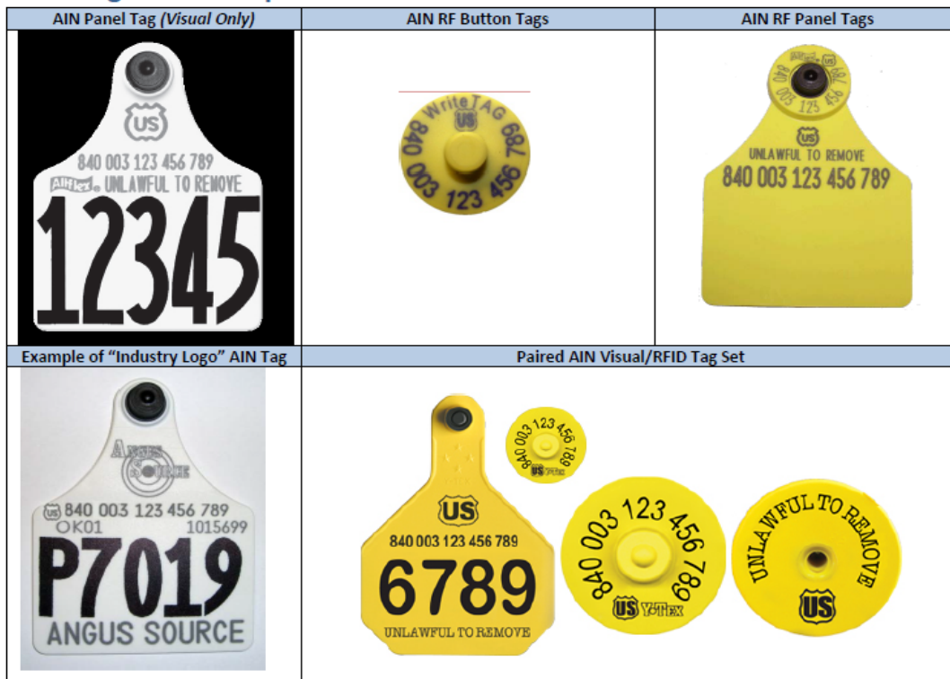
Figure 1-Examples of USDA official identification for cattle. All USDA Official animal identification number (AIN) tags, as pictured, are imprinted with a 15-digit number starting with 840 (840 is the official US country code), all have an official US ear tag shield, the words “unlawful to remove” and the manufacturer’s logo or trademark. Tags can be visual only (top left example) or may have RFID technology which allows them to be read visually or electronically. RFID tags must have all 15 digits printed on the button tag piece containing the transponder. Producers can purchase 840 tags from an authorized tag manufacturer or an accredited veterinarian who is qualified as a “Tag Manager”.

A useful system for evaluating health data will contain much of the same information used for analyzing performance. First and foremost, every cow and every calf must have individual identification (ID) that is readable, permanent and without duplication. Each calf ID must be matched with his or her dam ID. Ear tags are commonly used and ear tags with radio frequency identification (RFID) technology (see Figure 1) are growing in popularity because information such as weight can be automatically sent to the computer along with the electronic tag number with the use of a “reader”. Other useful information to record includes breed, sire, age of dam, calf’s birth date and sex, birth and weaning weights, weaning date, weight and/or body condition score of cows at weaning, and “contemporary group code” such as