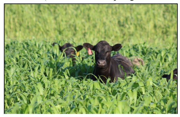
Figure 2. Sorghum-sudangrass is easily established once soil temperatures research 60 F and provides rapid growth and canopy cover outcompeting common summer annual weeds.

this seems to be a logical approach. However, it rarely works as well as we would like. The problem is that cool-season perennial grasses usually don't have enough time to become fully established before the weather turns hot. In addition, summer annual weed pressure can be fierce during establishment. The net result is that these attempts at reseeding pugged up pastures often fail. An alternative strategy involves planting summer annual grasses in late spring or early summer. This approach has a much higher probability of success. Summer annual grasses, especially sorghumsudangrass or sudangrass, have very rapid emergence and canopy closure. This will prevent