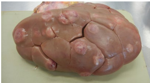
Figure 1: Lymphosarcoma in the kidney

How is BLV diagnosed? Blood testing is the first step to identify BLV-positive (infected) animals. An inexpensive serum ELISA test is available at the UK Veterinary Diagnostic Laboratory to detect antibodies to the virus. Once an animal is infected and tests positive for antibodies, she will remain test positive for her lifetime. Testing can be done in animals over six months of age. Peripheral lymphocytosis can be diagnosed by a complete blood count (CBC) on a blood sample submitted to a veterinary practice or vet diagnostic lab. Tumors such as lymphosarcoma are usually diagnosed after death at necropsy but some are identified