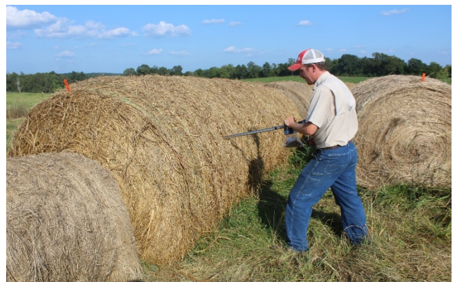
Figure 1. Always use a hay probe to sample bales. Round bales should be sampled from the sides and square

Sample hay just prior to feeding. Ideally, hay should be sampled just prior to feeding. This will provide the most accurate representation of nutritional. This is especially true for hay stored outside that has weathered. However, in some cases sampling early may be more practical. If you are storing hay in a