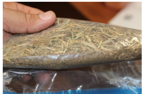
Figure 3. Never subdivide a sample before submitting it to the lab. Core samples are made up of both large and small particles that can segregate making it difficult to get a representative subsample. In this photo the fine particles have move to the bottom of the bag.

Do NOT submit excessively large samples. Forage testing labs will subdivide samples. They will NOT grind entire sample. This can significantly impact test results. The sample submitted should be no larger than one-half pound.