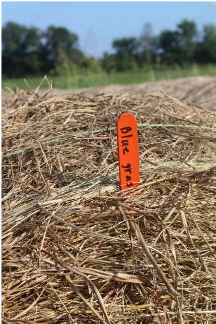
Figure 2. Make sure and keep track of where different hay lots are located. This can be accomplished by labeling where lots start and stop and drawing maps. This best done when hay is moved from the field to its storage location. This will help with sampling later.

Early sampling also allows you to better plan how and when certain lots of hay should be fed. For example, if you have a hay lot (one field-one cutting) that is very high in quality (cut early and cured well) then it could be fed when the nutritional requirements of the animal are the highest. Likewise, identifying hay lots that have marginal nutritive value early, will allow you plenty of time to plan appropriate supplementation strategies.