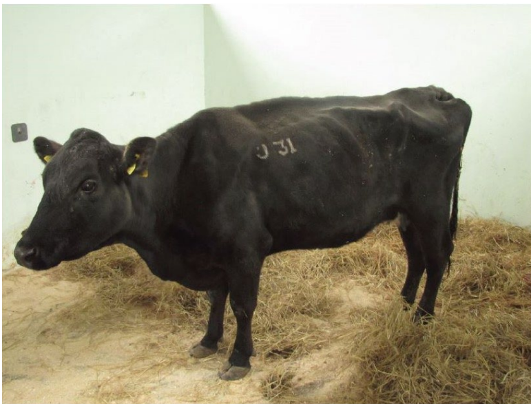
Figure 1: Recently calved cow with signs of Johne's disease; dull hair coat, profuse watery diarrhea, and weight loss. Photo from "Management and Control of Johne's Disease in Beef Sucker Herds" by Drs. Isabelle Truylers and Amy Jennings. In Practice July/August 2016/Volume 38, page 348.

Johne's (pronounced Yo-knees ) Disease is a slow, progressive disease of profuse, watery diarrhea and weight loss or "wasting" in adult cattle (Figure 1) caused by the bacterium Mycobacterium avium subsp. paratuberculosis , also known as "MAP". This disease begins when calves (not adult cattle) are infected with MAP-contaminated colostrum, milk, feed, or water, most often around the time of birth. Once MAP enters a calf, the organism lives permanently within the cells of the large intestine where it multiplies and causes the intestinal lining to slowly thicken. Over years of time, the thickened intestine loses the ability to absorb nutrients, resulting in watery diarrhea and weight loss despite continuing to eat well. There is no blood or mucus in the feces, no straining, and no fever. These symptoms do not show up in adult cattle until 2-5 years of age or even older. There is no treatment available, and the animal eventually dies due to starvation and dehydration.